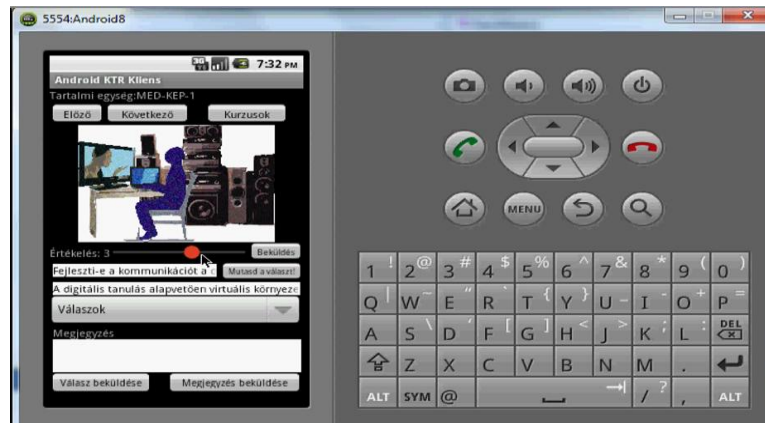
Figure 3. Client-side user interface development environment.

The following figure shows the client-side interface on Xamarin surface running a simulation.